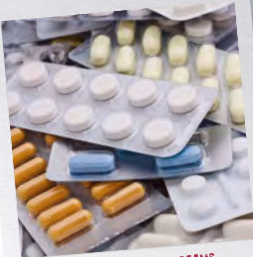
HEALTH AND MEDICAL SCAMS